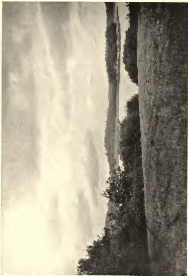
SITE OF CLARK AND LAKE'S GARRISON AND TRADING POST Arrowsick Island, Maine. The old cellars are marked by a growth of bushes along the water's edge